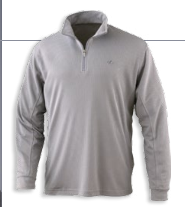
MESH HALF-ZIP PULLOVER

High-tech pullover is built for performance. Made from moisture wicking, 100% micro-mesh polyester enhanced with UV protection. Silverstone. M-XXL 00625-19143-89*